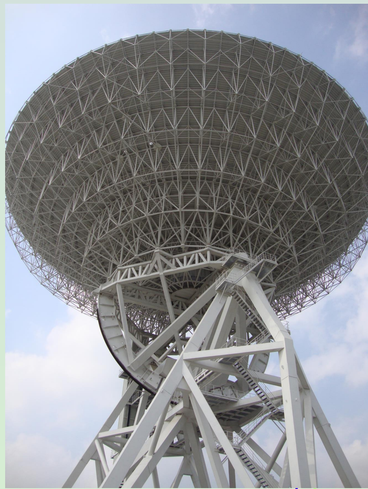
Tianma 65 m radio telescope near Shanghai, China

Based on our EVN data, we confirm that J1331+2932 is a blazar and thus the most likely counterpart of the Fermi LAT source. Wide-field Infrared Survey Explorer (WISE, Wright et al. 2010) data show significant flux density variations in the infrared.